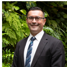
Courtney Street 02 49 26 3933

View : https://www.street.net.au/sale/nsw/newcastle-region/wallsend/residential/townhouse/7643378