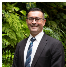
Courtney Street 02 49 26 3933

View : https://www.street.net.au/sale/nsw/newcastle-region/wallsend/residential/semi-detached/7747985