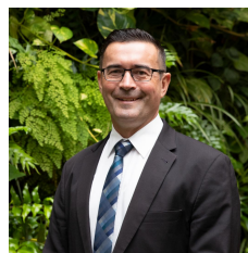
Courtney Street 02 49 26 3933

View : https://www.street.net.au/sale/nsw/newcastle-region/wallsend/residential/townhouse/8111044