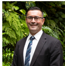
Courtney Street 02 49 26 3933

View : https://www.street.net.au/sale/nsw/newcastle-region/wallsend/residential/townhouse/8111044